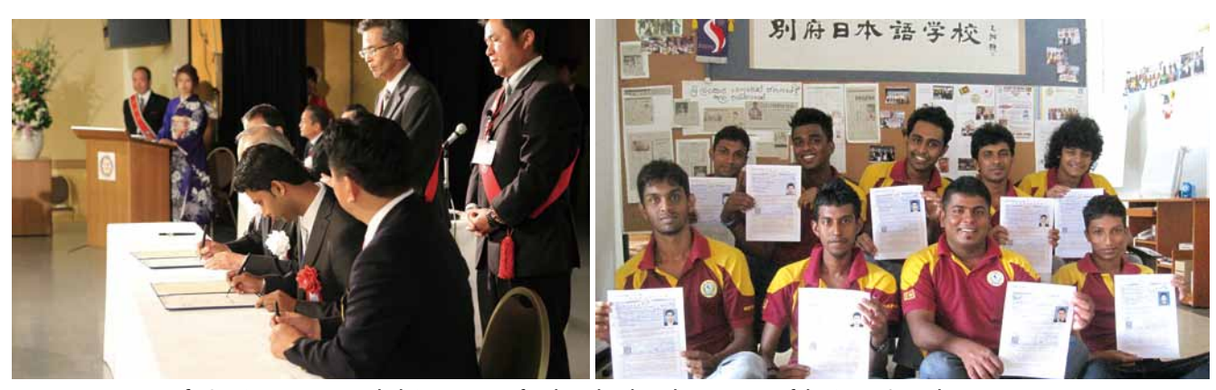
Left: Signing ceremony pledging support for the school on the occasion of the Beppu's 60 th anniversary. Right: The Gratuates of the Beppu Japanese Language School. They started to study in Japan in April 2013.

Somewhere along the way the loneliness and insecurity I felt when I first came to Japan had transformed into self confidence.